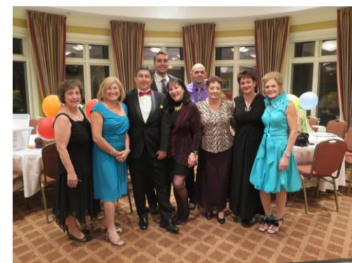
The volunteers who organized the gala

ccamre.educationprogram.cecilia@outlook.com